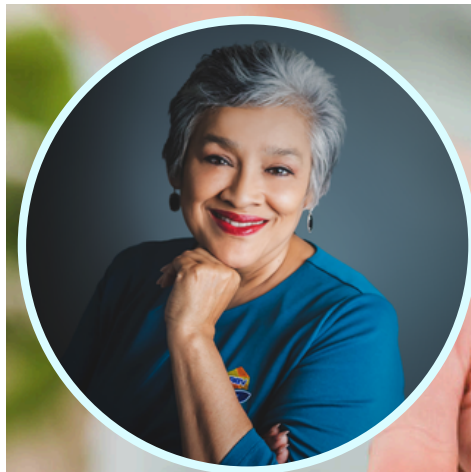
VP of Lending, NMLS #274381